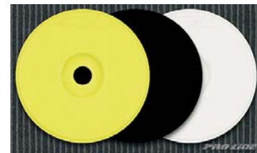
2702-02/03/04 Velocity V2 $15.50