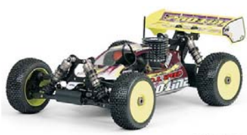
3289-00 SHIFT fits Mugen MBX-6 $33.00