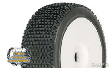
9029-00/01/02 Revolver $24.00/26.00