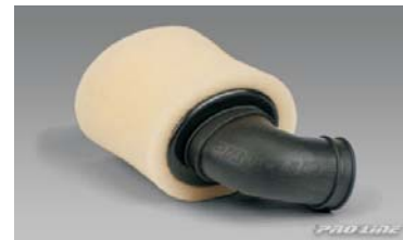
6118-00 1:8 Low Pro Air Filter Assembly $33.00