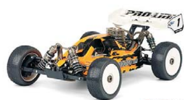
1496-00 HardDrive fits Losi 8ight $33.00